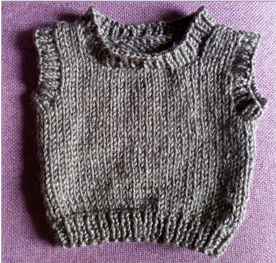
basic newborn baby vest